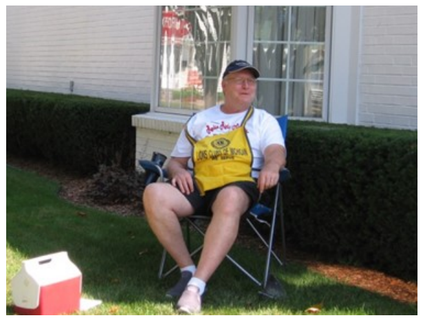
Funeral home parking lot guard