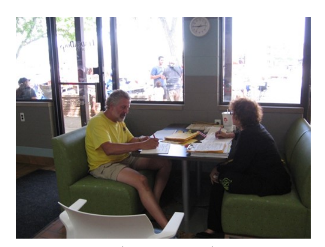
Recording winner sheets