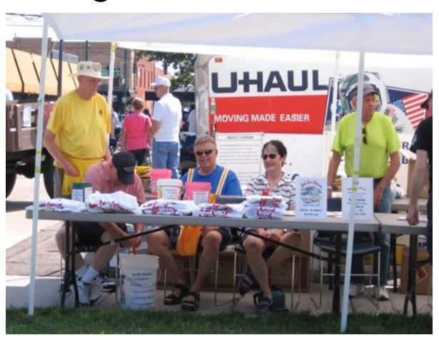
T-shirt and 50/50 gang