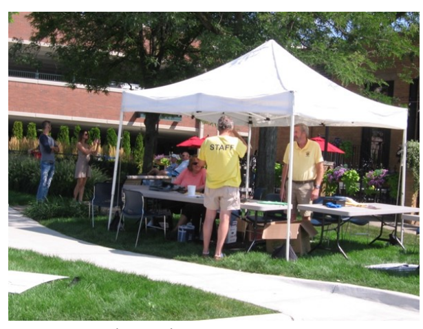
Show day registration